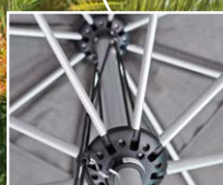
Heavy duty stainless steel pulley and rope system for durability