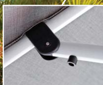
Strong glass filled nylon arm joints