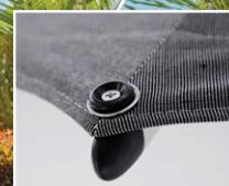
Fabric canopy secured with stainless steel screws