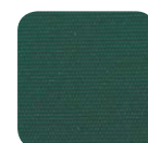
Forest Green (R102)