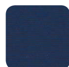
Navy Blue (R170)