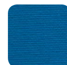
Royal Blue (R172)