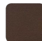
Chocolate Brown (R156)