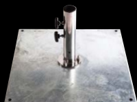
35kg/45kg Galvanised steel bases with 40mm or 50mm spigots