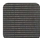
Charcoal Tweed (R770)