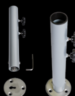
Camlock Spigot with 40mm or 50mm spigots