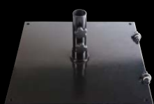
34kg Commercial steel base with wheels and 50mm spigot