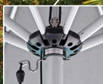
Internal pin guide for easy insertion of pin