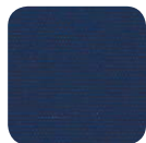
Navy Blue (R170)