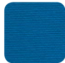
Royal Blue (R172)