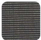
Charcoal Tweed (R770)