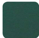
Forest Green (R102)