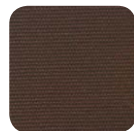
Chocolate Brown (R156)